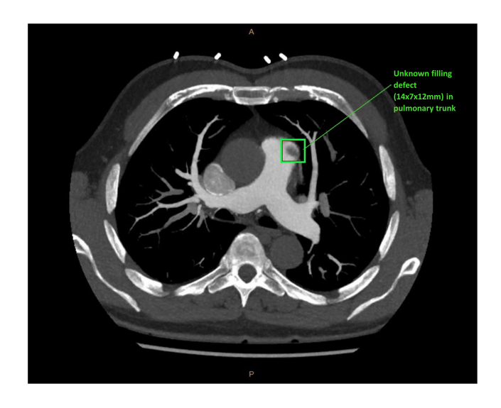
FIGURE 1 CTPA depicts an unknown filling defect in the pulmonary trunk region. CTPA, CT pulmonary angiogram.

To confirm the exact course of the fistula, the patient underwent a CT coronary angiogram (CTCA). The fistula